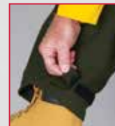
Velcro® cuff adjustment