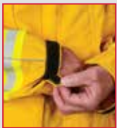
Velcro® sleeve adjustment