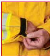
Velcro® sleeve adjustment