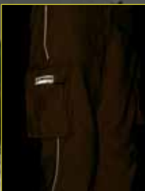
Scotchlite reflective material - 2" reflective triple trim on pant cuffs. Reflective Lakeland Fire logo patch. LazerMax™ reflective trim for additional nighttime visibility. LazerMax trim on: • Length of leg