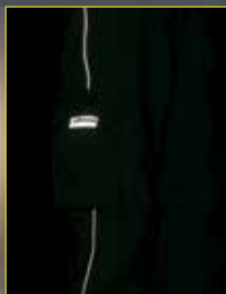
Scotchlite reflective material - Reflective Lakeland Fire logo patch. LazerMax™ reflective trim for additional nighttime visibility. LazerMax trim on: • Length of leg