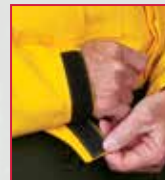
Velcro® sleeve adjustment