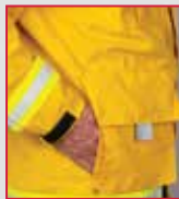
Large cargo/hand warmer pockets