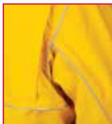
2 piece curved set-in sleeves for maximum mobility