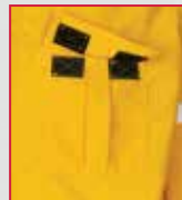
Pleated chest pockets with flaps