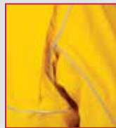
LazerMax™ reflective piping for superior nighttime visibility