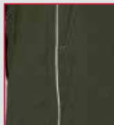
LazerMax™ reflective piping for superior nighttime visibility