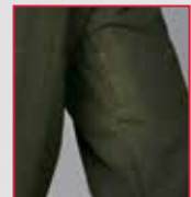
Discrete inner thigh and rear knee vents