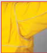
2 piece curved set-in sleeves for maximum mobility