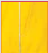
LazerMax™ reflective piping for superior nighttime visibility