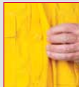
Hidden front button placard