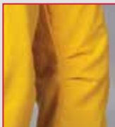
Triple pleated knees