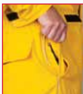
Pass thru pockets with snap closure