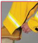
18" leg zippers