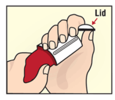
1. Remove top lid to expose scratch surface on the cap.

Before activating, stand in front of fireplace or wood-burning heater. Hold Chimfex at the base so it extends over the fireplace hearth or fireproof stove board.