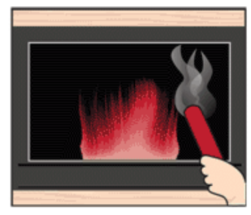
4. Immediately drop ALONGSIDE the fire – not directly in the fire.