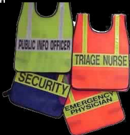
Available in Poncho Style