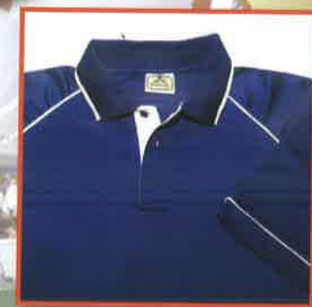
STYLE 500 - Pictured SIZES AVAILABLE XS-4XL

Men's Short Sleeve Performance Polo with Piping and Tipped Collar Trim