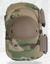
DEP-MC (MultiCam® Camo)