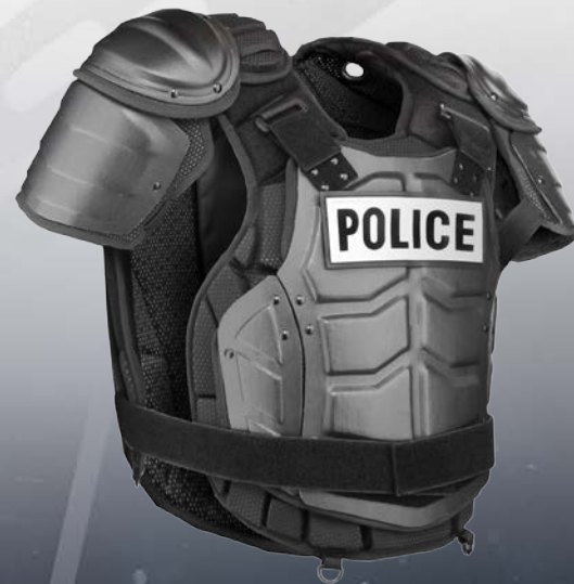
RIOT PROTECTIVE SUITS