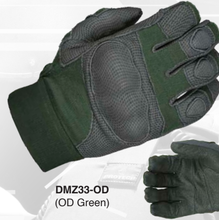
DMZ33-OD (OD Green)