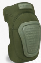
DNKP-OD (OD Green)