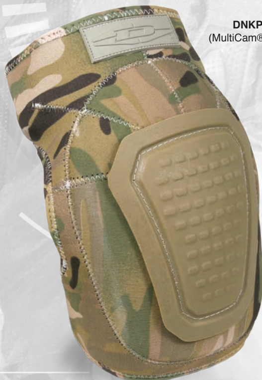
DNKP-M (MultiCam® Camo)