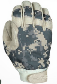
MX25-A (ACU Digital Camo)