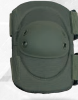
DEP-OD (OD Green)