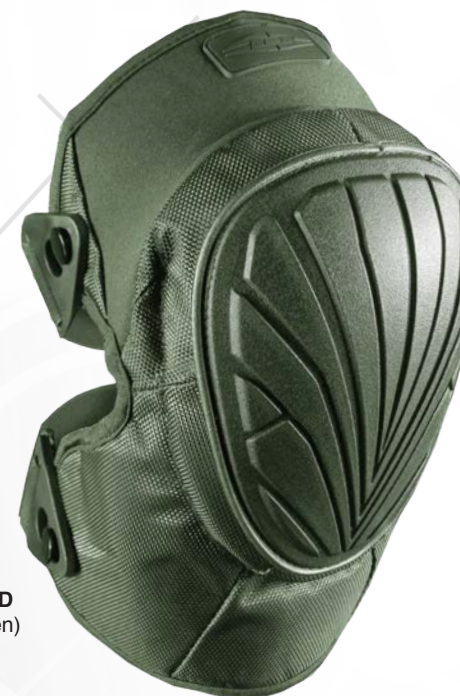
DKX1-OD (OD Green)