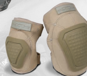
DNKP-T/DNEP-T (Coyote Tan)