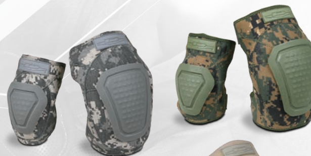
DNKP-DW/DNEP-DW (Digital Woodland Camo)