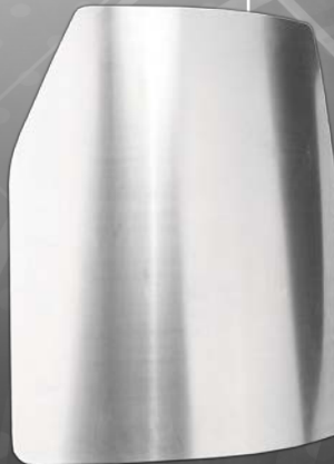
Aluminum Stab Plate Insert