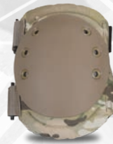
DKP-MC (MultiCam® Camo)