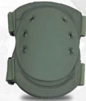
DKP-OD (OD Green)