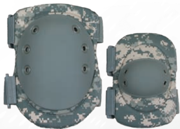
DKP-A/DEP-A (ACU Digital Camo)