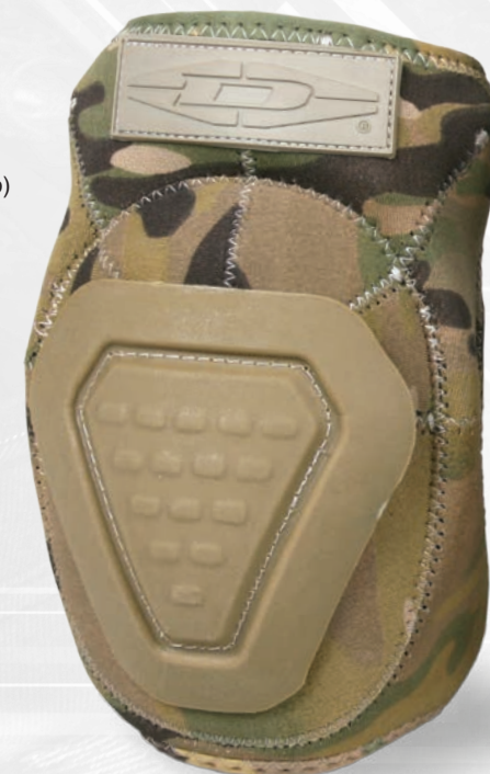
DNEP-M (MultiCam® Camo)