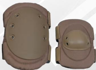
DKP-CT/DEP-CT (Coyote Tan)