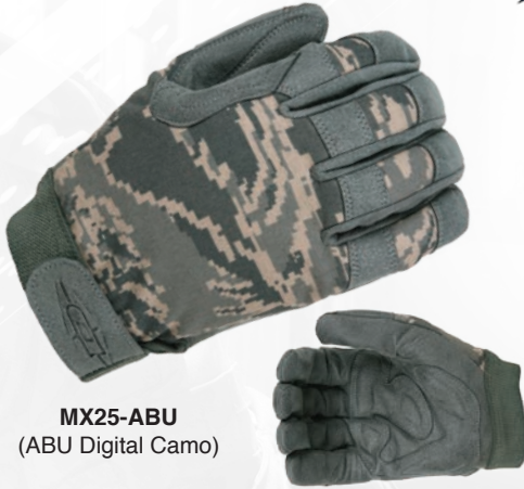
MX25-ABU (ABU Digital Camo)