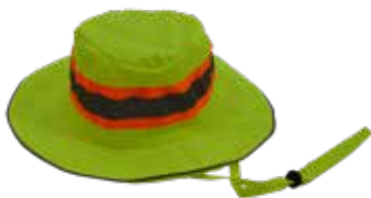
Hi-Vis Head Gear