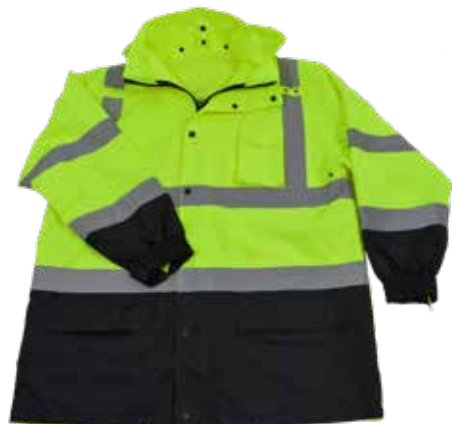
Light Weight Class 3 Outer Jacket