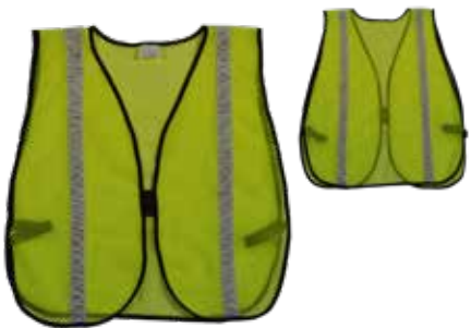
LVM-HG / OVM-HG Mesh Safety Vest - High Gloss Tape