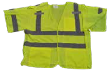
ANSI Class 3 Breakaway Safety Vests