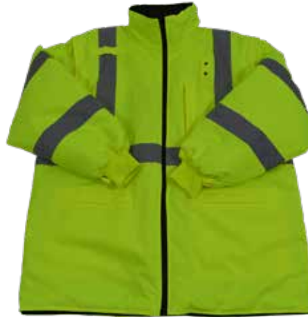
Reversible Class 3 Inner Jacket: Lime side