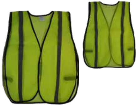
LVM-S / OVM-S Mesh Safety Vest - Silver Tape