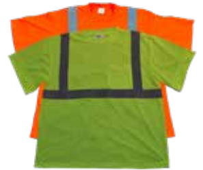
ANSI Class 2 & 3 T-shirts