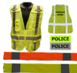
Hi-Vis Accessories & Services