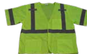
LVM3: Old Style