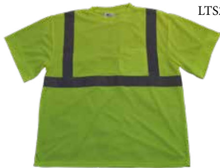
LTS2 / OTS2