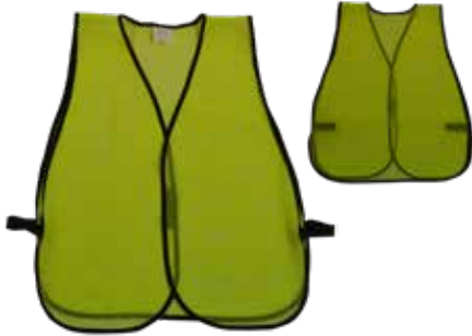
LVM-0 / OVM-0 Mesh Safety Vest - No Tape