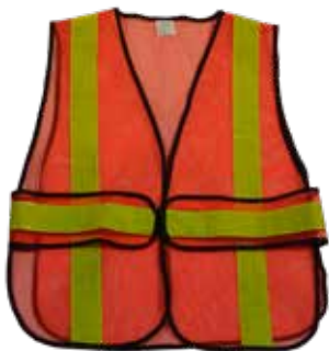
Mesh Vest With Adjustable Sides & Reflective "X" On Back