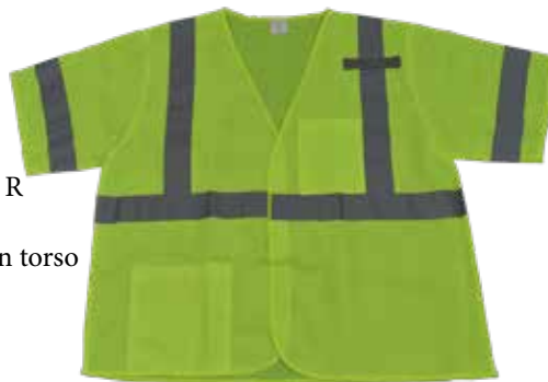
LVM3: New Style