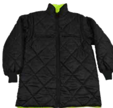
Reversible Inner Jacket: Black Quilted Side