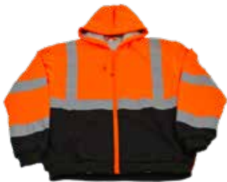
ANSI Class 3 Jackets & Sweatshirts