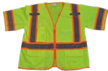
ANSI Class 3 Safety Vests