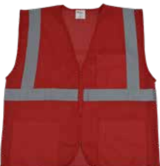
Red Mesh Safety Vest for Enhanced Safety & Identification