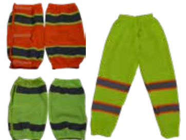
ANSI Class E Pants & Leggings