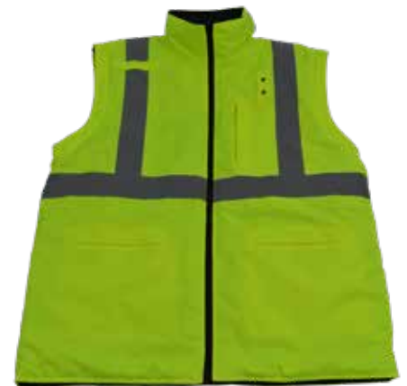
Reversible Class 2 Vest: Lime Side