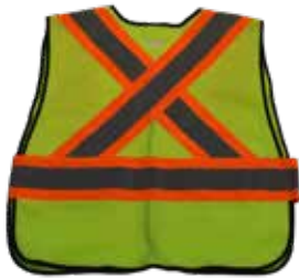
Breakaway Vest "X" on Back