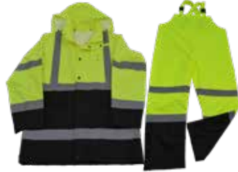
ANSI Class 3 Rain Gear