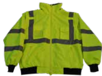
ANSI Class 3 Waterproof Winter Jackets