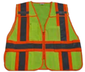
Breakaway Safety Vests