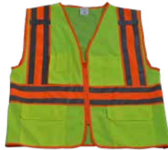
Two Tone DOT Safety Vest