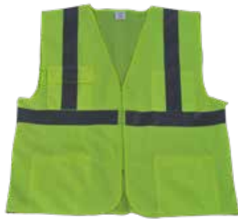
ANSI Class 2 Safety Vests