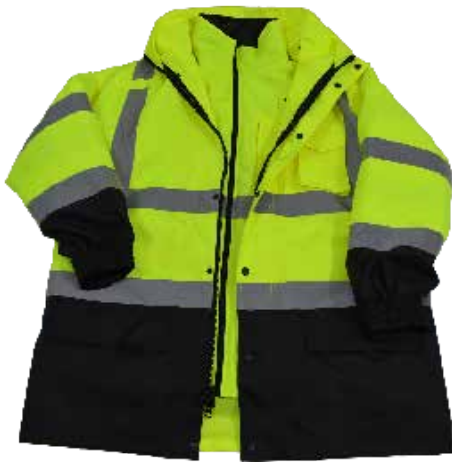
Outer & Inner Jackets Assembled