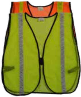
All Purpose Safety Vests