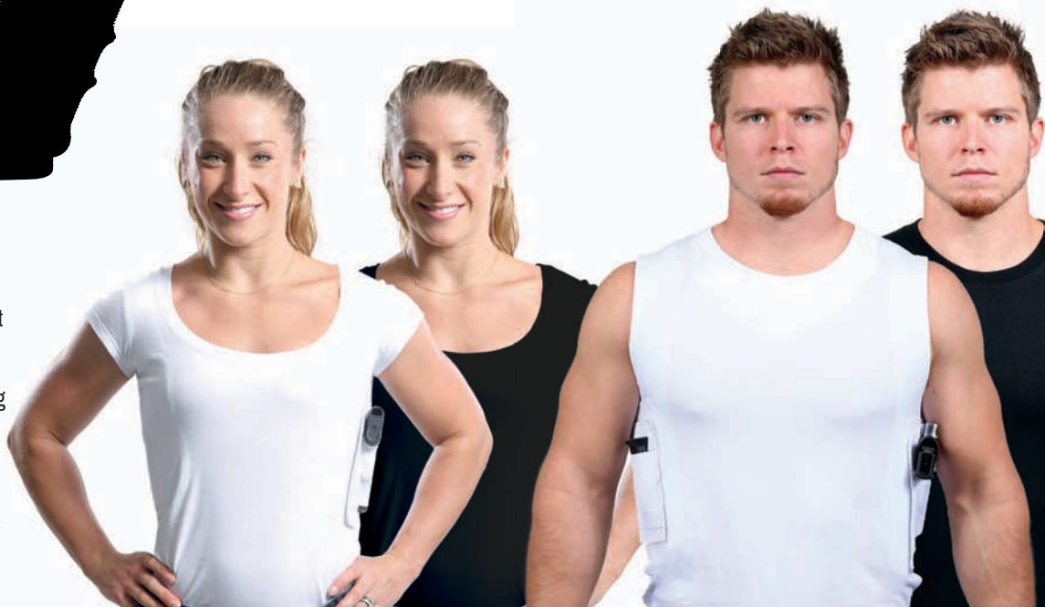
WOMEN'S SCOOP NECK