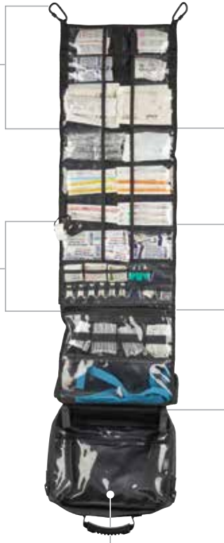
Bottom section catch-all for personal belongings and items