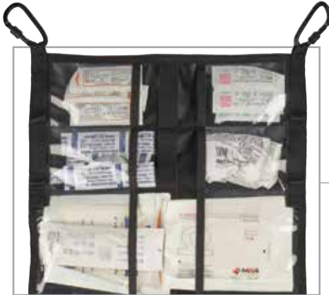
Multiple carabiner attachment locations to fit a range of vehicles

The I.V.S.S. PRO IV Solution is the most compact, versatile, and organized way to transport and deploy IV solutions and supplies. This accordion style roll-out system hangs vertically in a variety of transport vehicles and helo-medevacs. The entire system rolls up into a compact briefcase for transport and re-stock. Constructed from wipe-clean infection control materials designed to easily clean and remove blood borne pathogens, this response system is the ready to assist delivering IV solutions quickly and effectively.