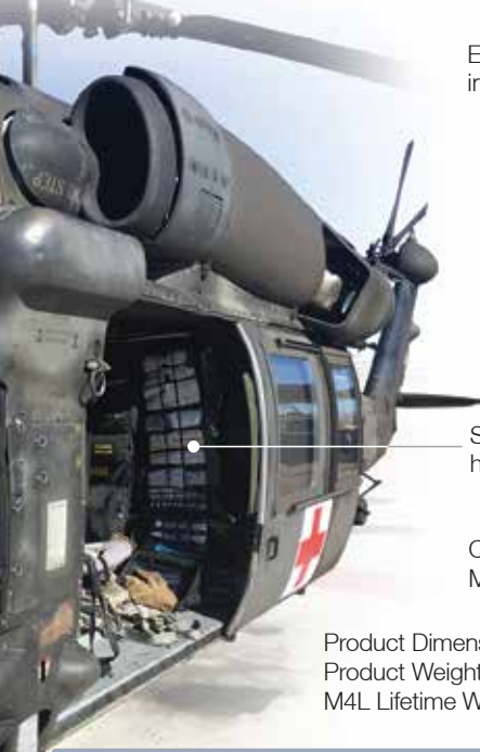
Easy spray wipe-clean infection control material