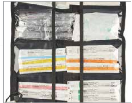
Easy-access large pockets for a range of supplies