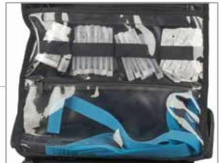
Large rear pockets (on reverse side) with front access to IV solutions