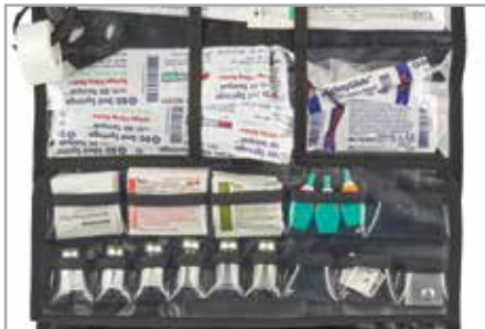
Smaller pockets for medications. Ped's/Brosslow tape integration